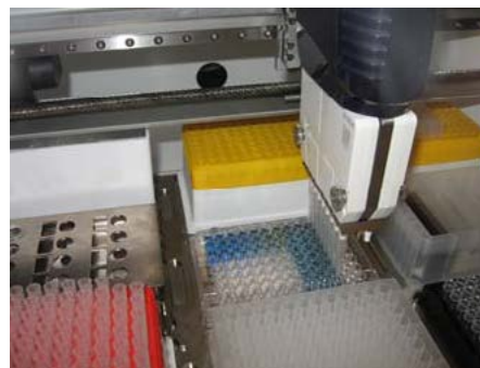
Figure 1 PIPETMAX 268 Performing the Bradford Assay.

The Bradford Assay performed in this application was automated using the PIPETMAX 268 bench top pipetting system (Figure 1). Absorbance of the Coomassie dye bound to albumin protein was measured with the Vmax® Kinetic Microplate Reader. Results were compared with manual method performance using a combination of the PIPETMAN® L Single Channel and PIPETMAN® M Multichannel pipettes.